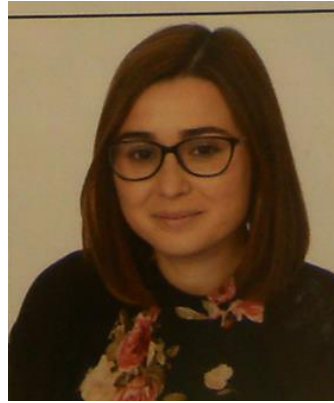
Miss Green 6 Einstein