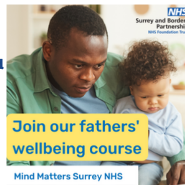
Mind Matters Surrey NHS