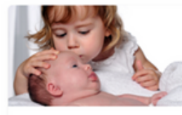
A New Baby in the Family