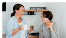
Coping with teens