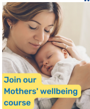
Mind Matters Surrey NHS

Or alternatively you can ask your GP to refer you