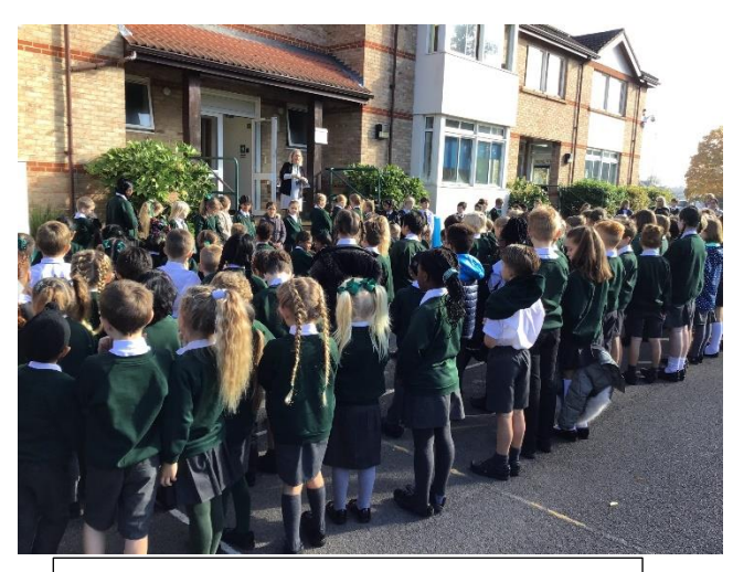
Praying the Rosary as a whole school