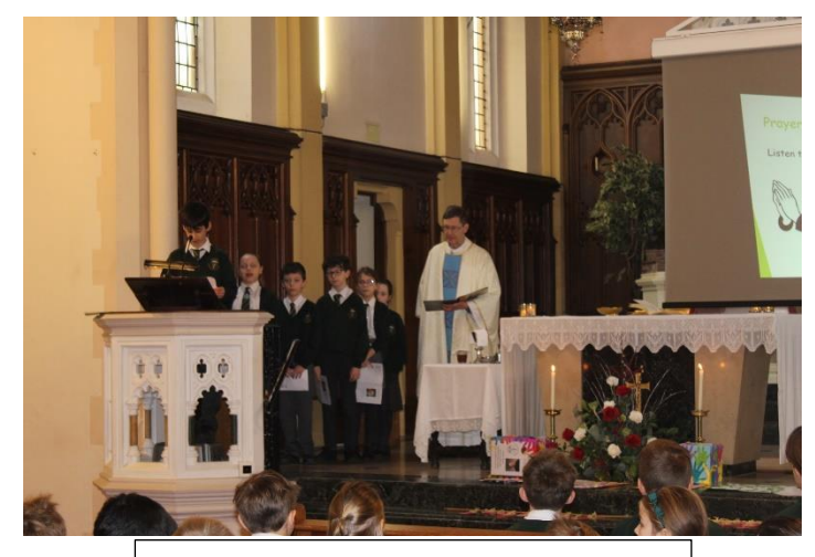
Whole School Celebration Masses